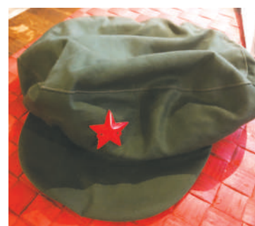
Little Red Book not included: Brought back from China, this week's second prize.

• The Style Conversational: The Empress's weekly online column discusses each new contest and set of results. See this week's at wapo.st/conv1404 .